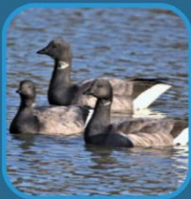
Dark-bellied brent geese

Each winter over 125,000 waders and wildfowl return here from as far as the Arctic. This makes the Solent coast of worldwide importance for birds.