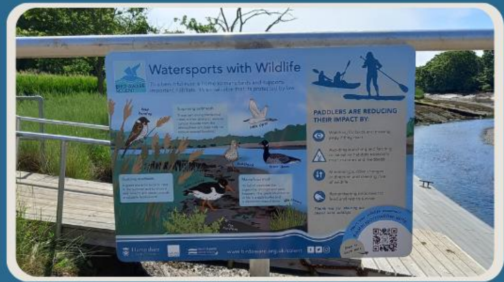
River Hamble Wildlife Aware Signs