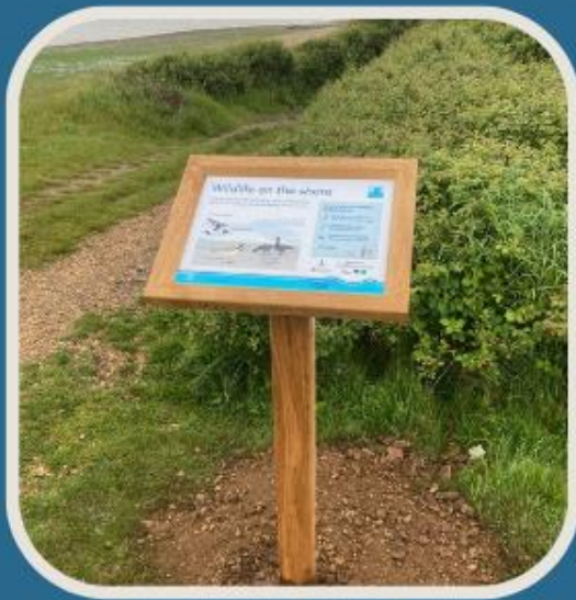
England Coast Path