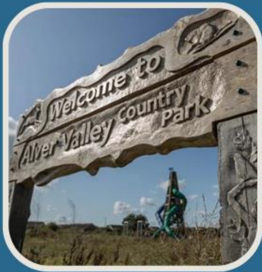
Alver Valley Country Park