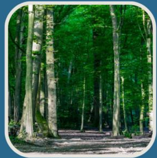
River Hamble Country Park